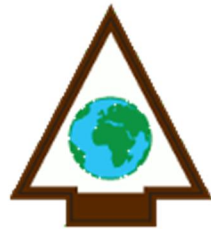
Building a Better World