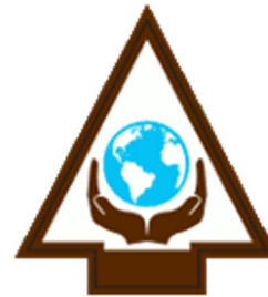
Duty to God In Action