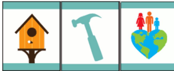
Fur, Feathers & Ferns