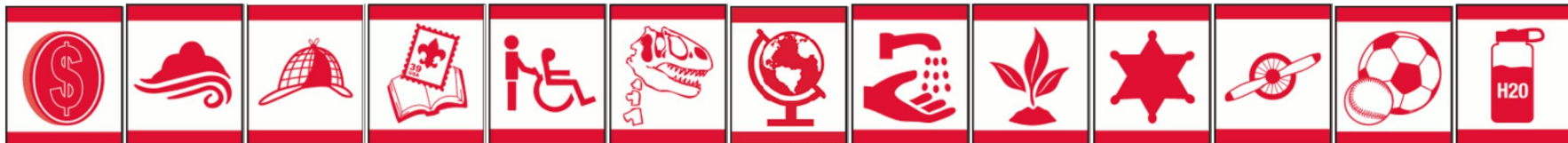
Adventures in Coins