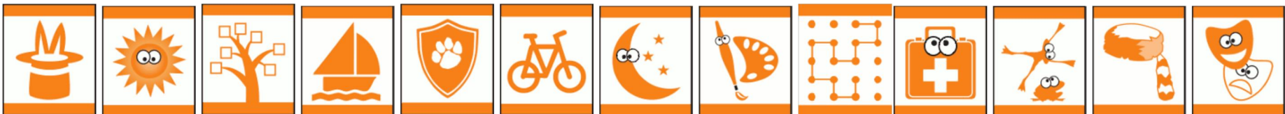
Curiosity, Earning your Stripes Magical Mysteries