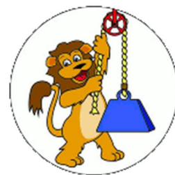
Gizmos and Gadgets