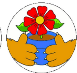
Ready, Set Grow

Parents actively work with their Cubs to complete Lion Adventures in their Lion Adventure Book.