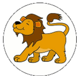
I'll Do It Myself