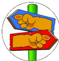
Pick My Path