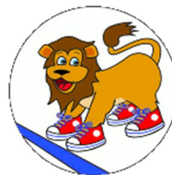
On Your Mark