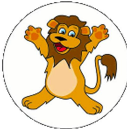
Fun on the Run