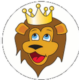
King of the Jungle